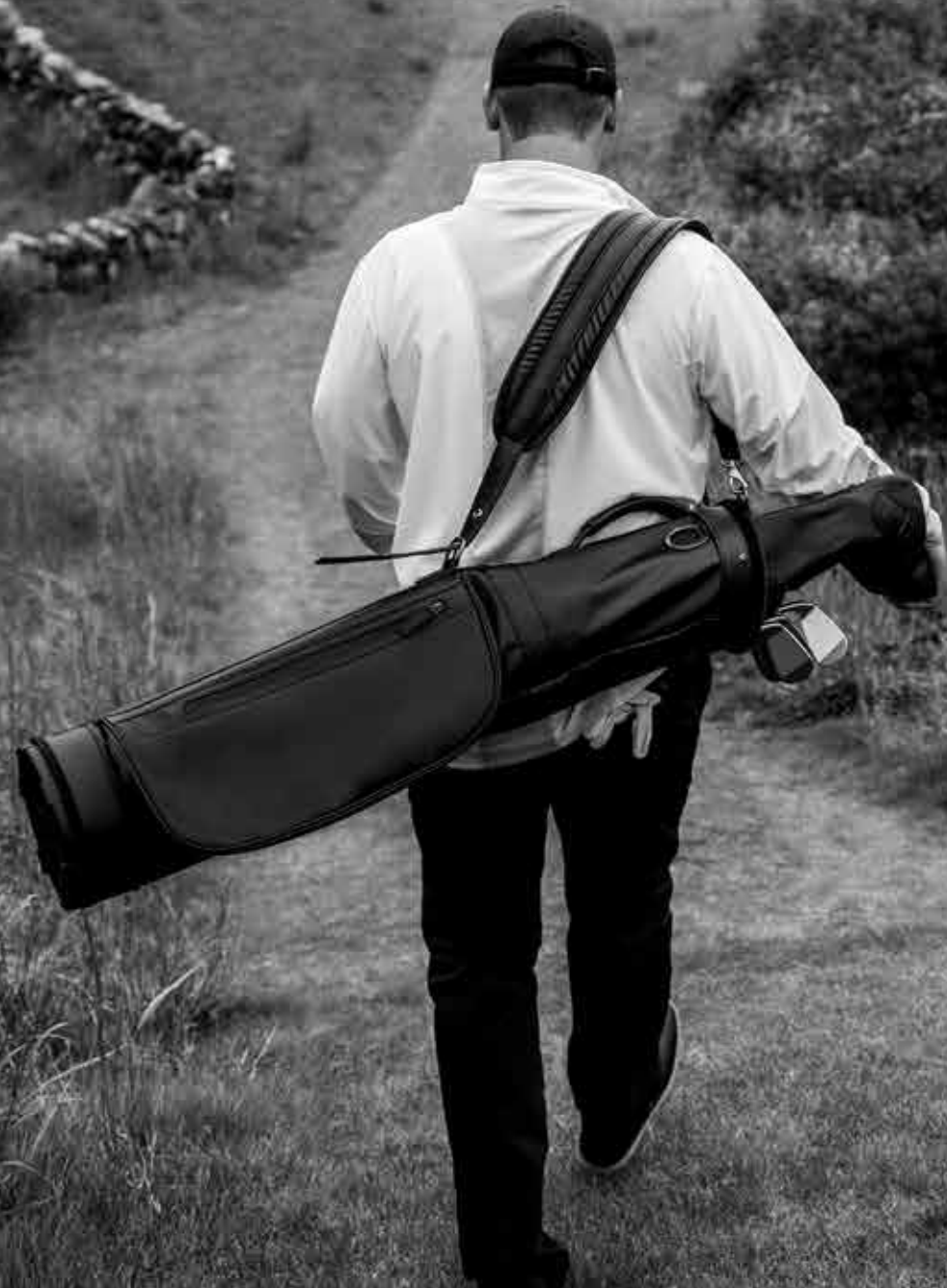
LINKSLEGEND Carry Bag, black