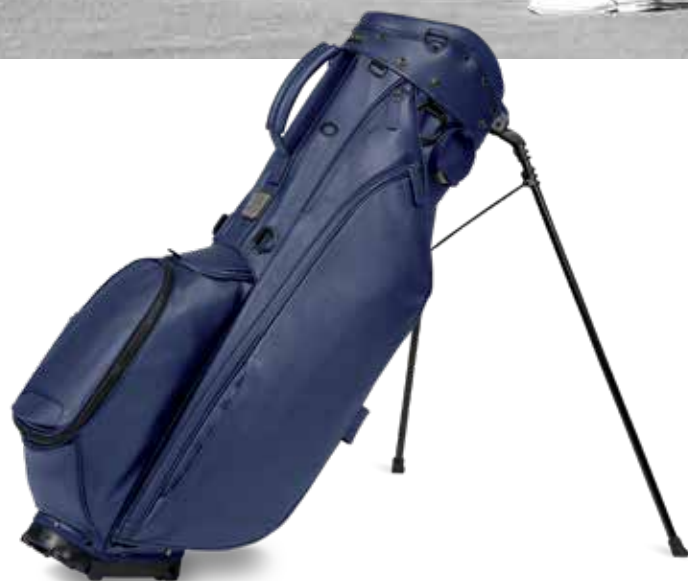
THE CLASSIC MEMBERS BAG