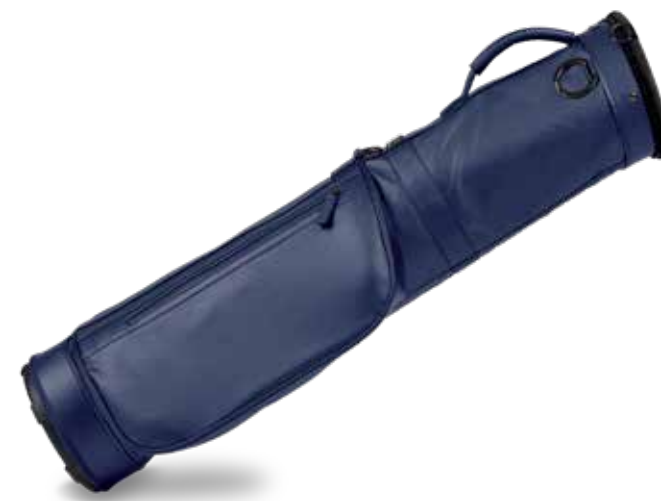
THE CARRY BAG