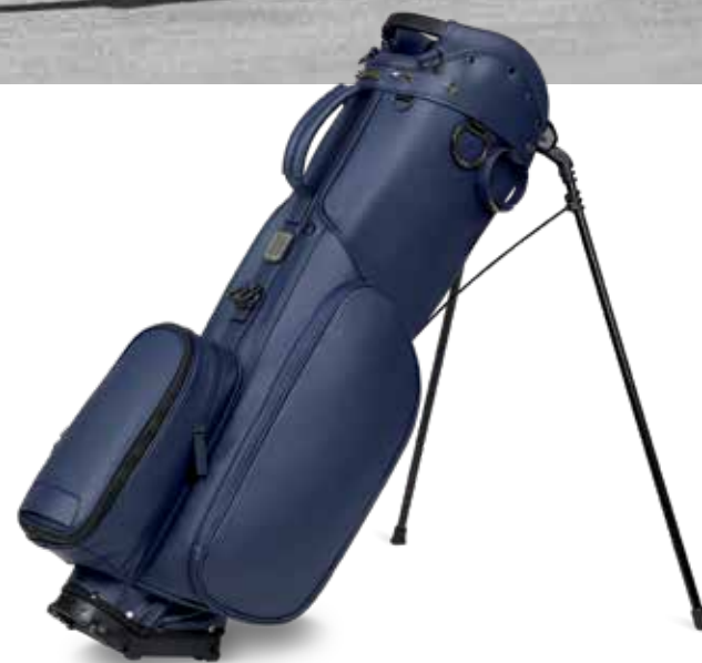
THE CADDIE BAG