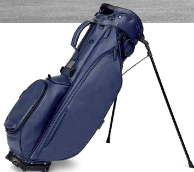
THE MEMBERS BAG