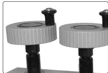
▲ Torque limited knob screws with Zero back-lash installed as standard.