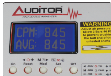
▲ New Shaft frequency analysis engine. Has auto reset and auto averaging function and Programmable profiling zones.