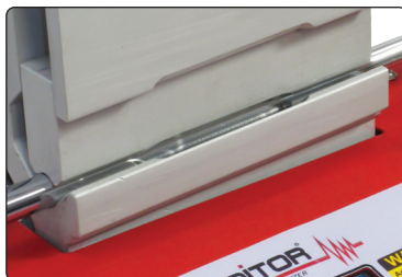
▲ New shaft clamp with machined seats provide excellent coupling with even pressure distribution over the shaft